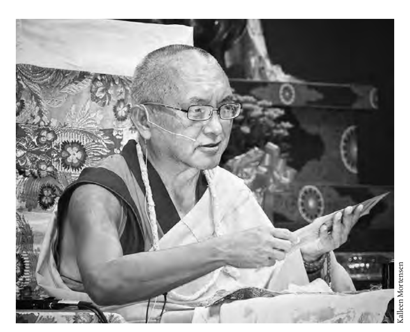
Deer Park, Wisconsin, 2008